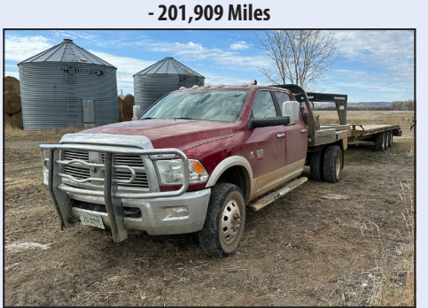
2011 Dodge Ram 3500 Dually Diesel with Dew Eze