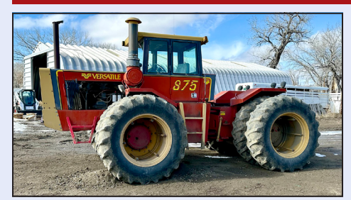
Versatile 875 Tractor with Duals