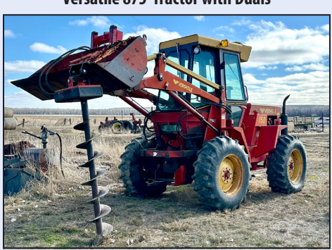
Versatile 150 Series LI Bi Directional w/Loader 4028 hrs.