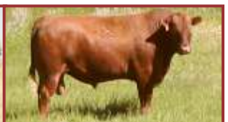
KRP KANYON MAKER 3853 2013-...