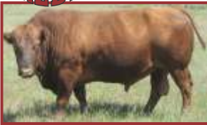
KRP KANYON 740333 2000-2011