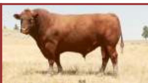
KRP MAKE A MILL 2054 2012-2023