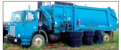
2005 Autocar Model 999 Garbage Truck Dura Pack 7000, tandem axle w/3rd air lift tag axle, runs good, diesel engine, auto transmission, 100,000 miles. VIN #5VDC6MF55H201463.