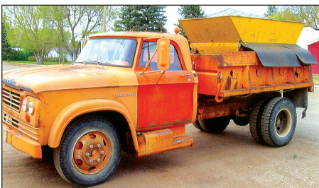
1964 Dodge D500 Dump Truck With gravel box, 27,450 miles, runs good, VIN #1581360260.