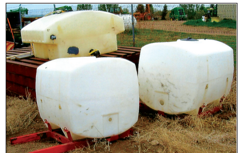
(2) 200-gallon Plastic Water Tanks (2) 450-gallon Plastic Water Tanks