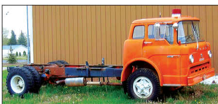
1975 Ford Cabover Truck Single axle, Bean model 900, cab and chassis, 429 V8 gas engine, runs good, 13,000 miles.