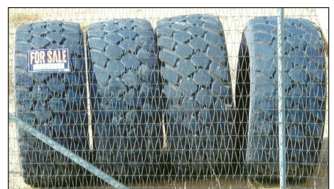
(4) Used Michelin Radial, Loader, Tires 625/70 R25, 30% rubber left, all hold air, never been run flat.