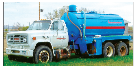
1988 GMC 7000 Water Truck 2000-gallon tank w/pump, 366 gas engine, manual transmission, tandem axle, runs good. VIN #1GDS7D4E5JV505677.