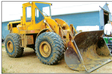
1976 Caterpillar 966C Loader 4-yard bucket, working condition, good tires, 76J8804.