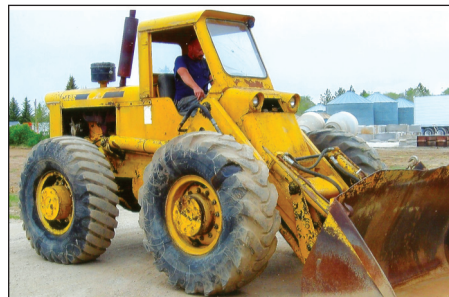
1965 Model W10 Case Loader 2-yard bucket, diesel engine, runs good.