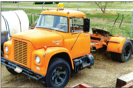
1964 International Truck/Tractor Runs, 348 gas engine, serial #5B-430222.

4246 Highway 16 South – Plentywood, Mt. East side of Plentywood right along Highway 16