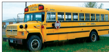
1993 Ford School Bus Diesel engine, manual transmission, runs good. VIN #1FDPJ75C7PVA29544.