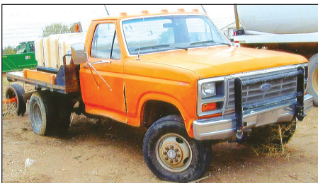
1986 Ford F350 4x4 460 gas engine, 66,706 miles, runs good, VIN #1FDKF38L6GPB53695.