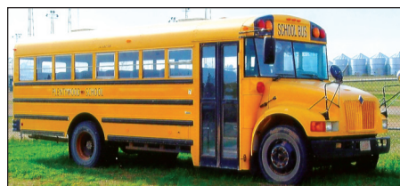
2002 International School bus DT 466 engine - bad, automatic transmission, 42-passenger.