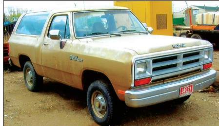
1992 Dodge Ramcharger 150 Needs work, 191,399 miles, VIN #3B4GM17Y1LMO41059.