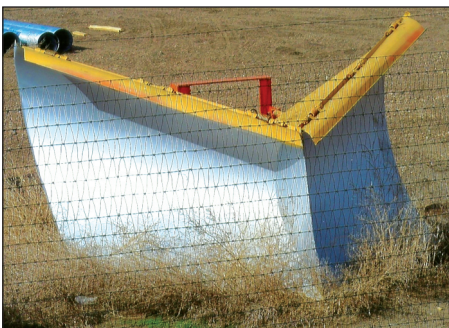
(2) Falls Front Mount V Plows, 10-foot.

Several Grader Mount Snow Wings Right hand, Balderson and Falls models.