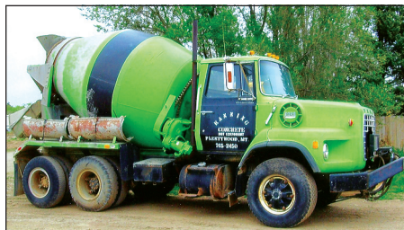
1974 Ford 9000 Cement Mixer/Truck 671 Detroit diesel, everything works, 8-yard tub.