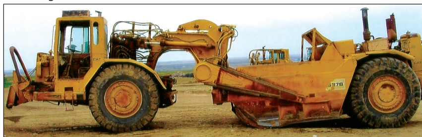
1979 Caterpillar 627B Scraper - 37V888, 37N0888.