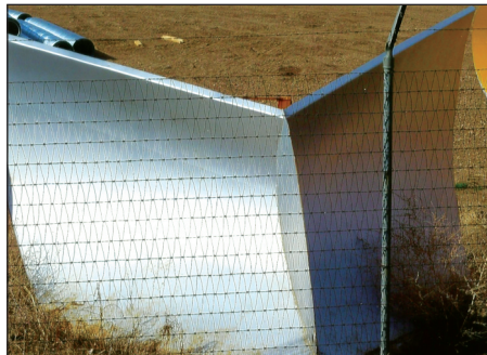
(1) Falls Front Mount V Plow, 12-foot.