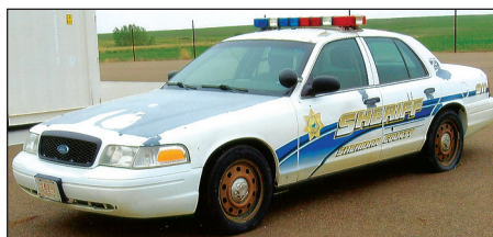
2006 Ford Crown Victoria 4.6 litre, police interceptor, 4-door, 130,000 miles, runs excellent.