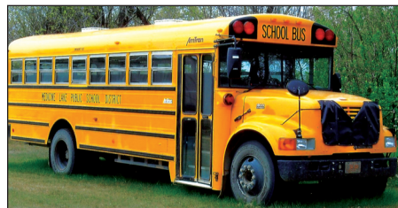
2000 International School Bus DT 466 engine - bad, automatic transmission.