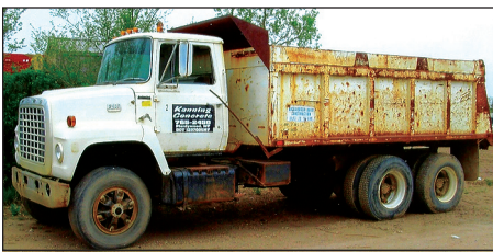
1973 Ford 8000 Dump Truck 15 yard gravel box, Cummins 250 engine - bad, new hoist cylinder.