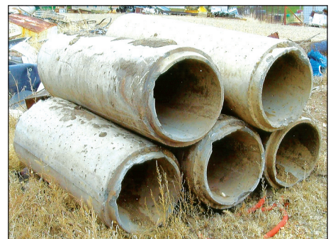
Several Used Culverts Various diameters, various lengths.