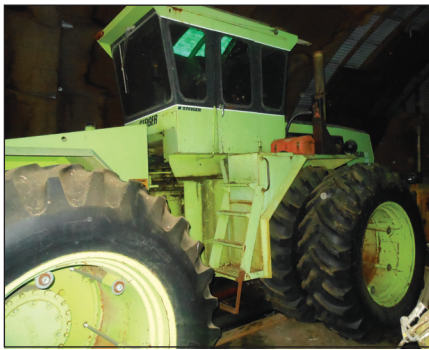
1979 Steiger ST270 Cougar III Approx. 12000 Hrs., Good Rubber