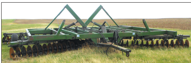
Big G Tandem Disc 28'

Gysler Toolbar 40' with Extensions 4 DK 5 Noble Drills 28' With Hitch