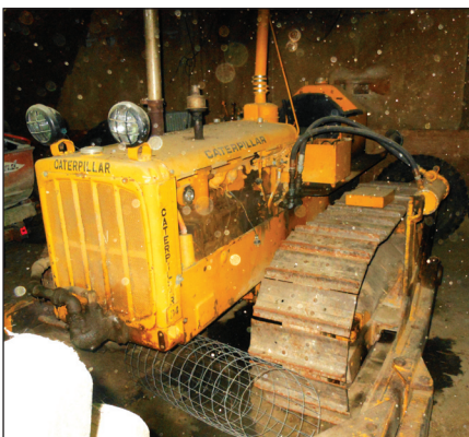
D4 Caterpillar Dozer - Angle Dozer