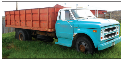
C50 Chevy Truck with Box and Hoist, 64000 Miles, 4 Spd., 900x20 Rubber