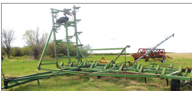
1600 John Deere Toolbar 41'