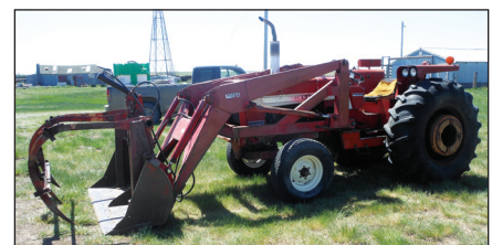
1965 International 656 Hydro with Leon Loader 65 HP, Gas Engine with 200 Hrs. on a Fresh Overhaul