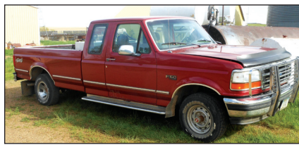
1983 Ford F150 XLT 4x4 Pickup, Extended Cab, 109,259 Miles, Automatic Transmission