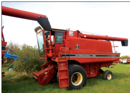
1980 1460 International Combine 5636 Hrs., Serial #1700222U012126, 24' Header, Duals, 810 International Pickup Header