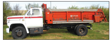
1981 GMC C60 Truck with Farmhand 450 Manure Spreader Box