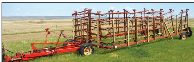
Melroe Drags 60'