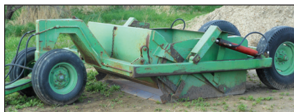
1975 Crown 600 Dirt Scraper

Melroe Spray Coupe MF Pull Type Swather, Canvas Stored Inside 6" Mayrath Auger 6" GT Auger PTO Drive, 30' HD8 1600 Sakundiak Auger, Damaged