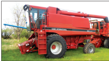
1983 1680 International Combine 4211 Hrs., Serial #JJCO 117464, 30' Header, Lots Of New Parts