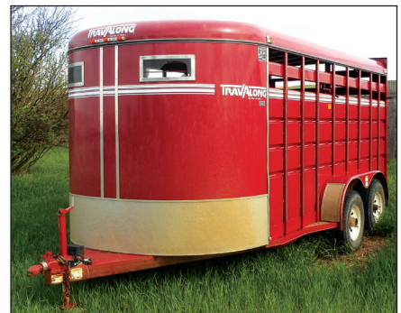
1993 Travelong Bumper Pull Trailer, 6'X16', 6000# Axles (Nice)