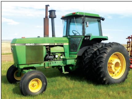
John Deere 4640 8346 Hrs., Quad Range Transmission, Heat, A/C, Duals, Rubber Fair