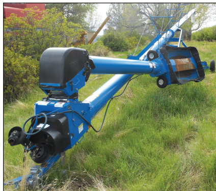
Brandt 1060 PTO Auger with Swing Away Hopper and Hydraulic Lift (Nice)