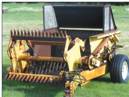
2 Degelman Rock Pickers