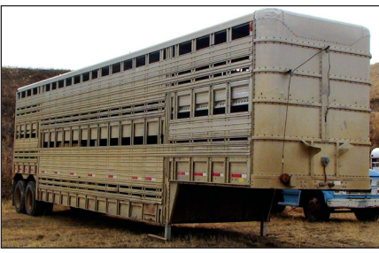
1976 46 X 96' Wilson Cattle Pot