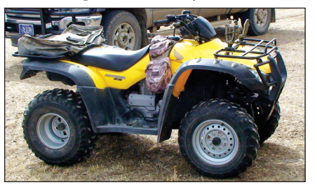
2004 Honda Rancher 350 ES, 2 WD, 1750 Miles

You Won't Find Any Cleaner, Low Milage Hondas Anywhere!!