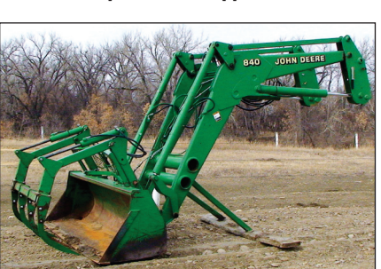
John Deere 840 Loader W/ 8' Bucket & Heavy Duty Grapple. Self Leveling / Quick Tach. With Mounts For 8000 Series

4010 John Deere W/ Cab Diesel, 3 Pt. New Rear Tires 656 IH Tractor W/Leon Loader (65 Hp Gas/Hydrostatic / 200 Hrs. On Overhaul)