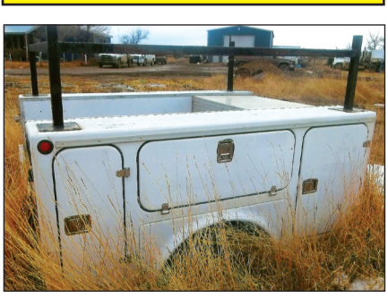
FX 8' Utility Box

John Deere 18.4, 38 Duals/Hubs Off JD 4630 3 Pt. Add On For John Deere 30-40-50 Series Tractors New Foam Marker For Sprayer Alco Pressure Washer 250 & 500 Gal. Fuel Tank On Stand DR Trimmer, 6.0 HP Huskee Red ATV Wagon ATV Snow Plow 5' Bobcat Bucket 7' Bucket For John Deere 158 Loader Shaver Post Pounder 5th Wheel Hitch For Semi B & W Turnover Ball Tools & Socket Sets Silage Sides/End Gates/HD Tip Tops