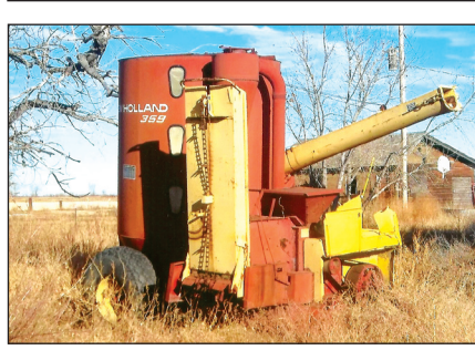
New Holland 359 Grinder Mixer SN 586210